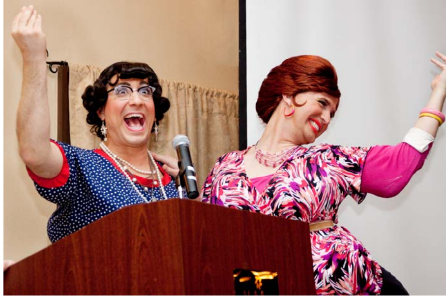
Bursting on the scene through the kitchen doors, The Calamari Sisters spiced up evening!